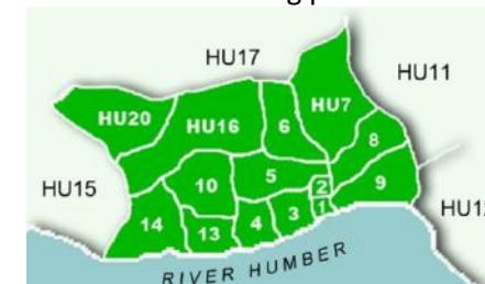
Hull and surrounding postcodes